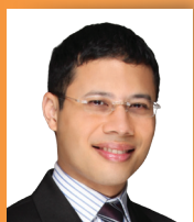
Mr Desmond Lee Ti-Seng Senior Minister of State Ministry of Home Affairs and National Development Member of Parliament for Jurong GRC