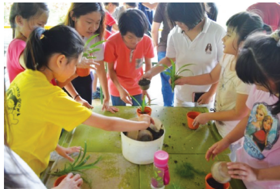
Students planting their own plant