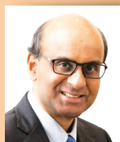
Mr Tharman Shanmugaratnam Deputy Prime Minister & Coordinating Minister for Economic and Social Policies Member of Parliament for Jurong GRC