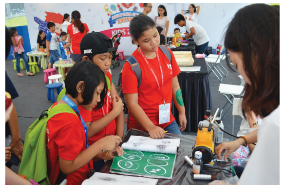
Getting their airbrush tattoo