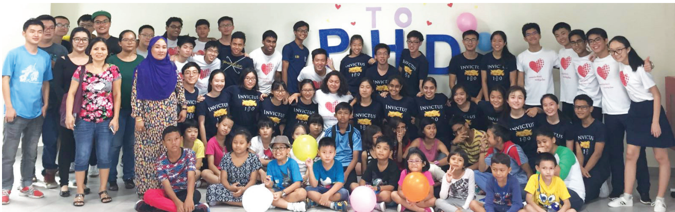
Volunteers and beneficiaries in Project Happy Day