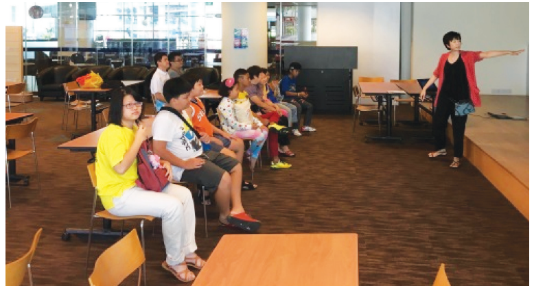
Briefing by the librarian