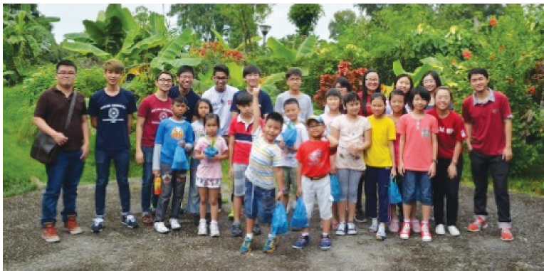
Group Photo at Bollywood Veggies