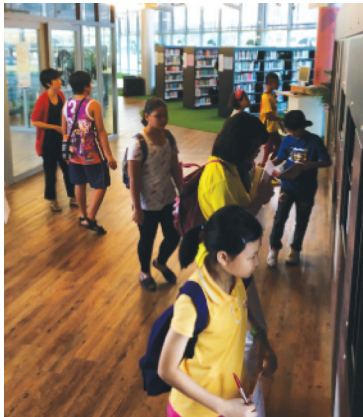
Students searching for books