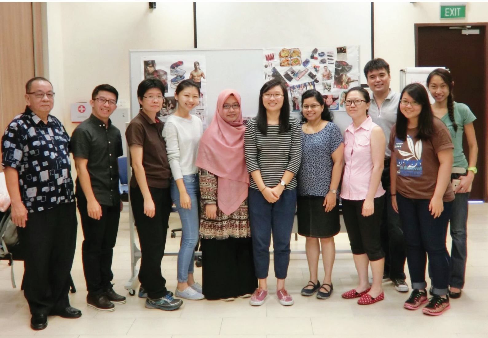
The volunteers in the mentors’ training session

The aim is to impart positive morals and values through entertaining games and activities in these group mentoring sessions. It encourages healthy socio-emotional development for students. Volunteer Mentors are mandated to undergo a training course conducted by Boys’ Town professionals. The training gears the volunteer mentors with the fundamental skills to conduct the mentoring sessions with their mentees more effectively.