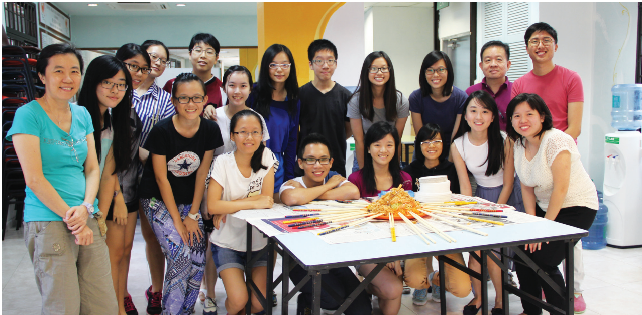
Free Tuition volunteers at the Chinese New Year gathering held at the Activity Centre

Loving Heart Multi-Service Centre (Jurong) Free Tuition was established in 2005. As the tuition costs rised in the market, Free Tuition served to assist less-priviledged children residing in Jurong GRC, Bukit Batok SMC and Yuhua SMC, with their revision to keep up with their peers.