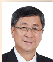
Mr Lim Boon Heng Chairman of Temasek Holdings Private Limited