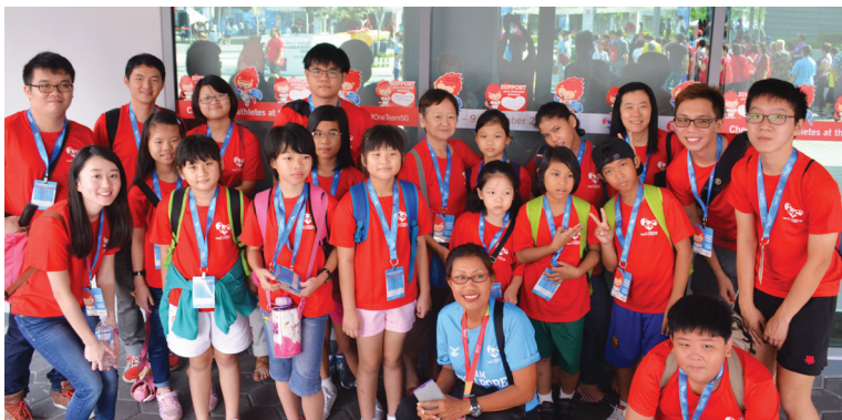
Group photo at the Para Games