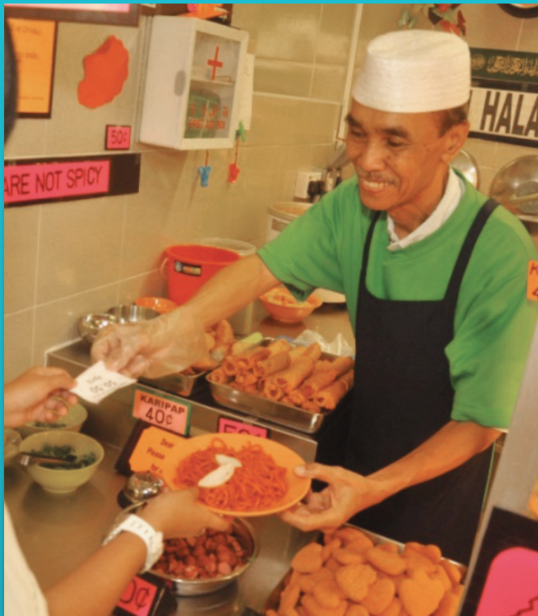
Students exchanging their coupons for food in the school canteens

We acknowledge with gratitude the joint sponsorship of this project by the following institutions: