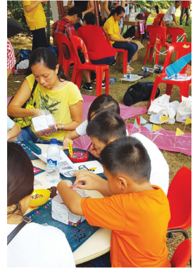
Students making customized keychains