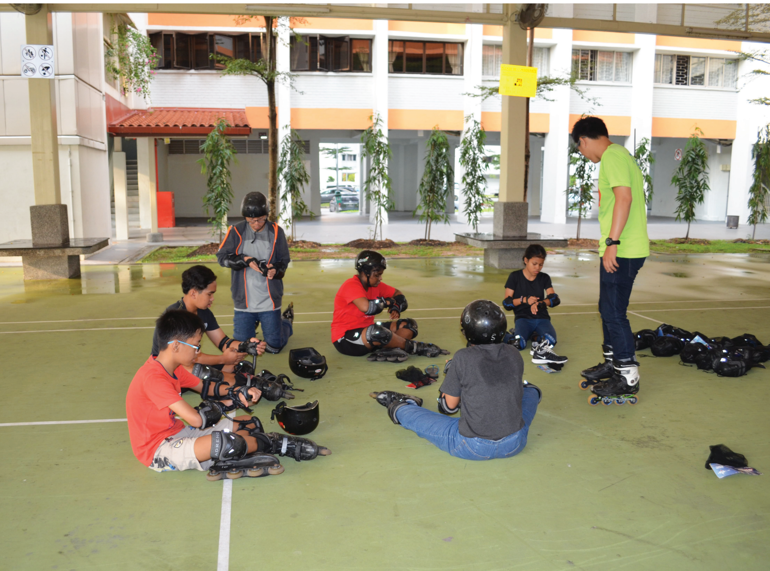
Community S.T.A.M.P participants in the in-line skating training

Loving Heart Multi-Service Centre and Activity Centre were used for mentoring and tuition sessions whereas the sports sessions were held at the covered activity plaza between Blk 312 and 316.