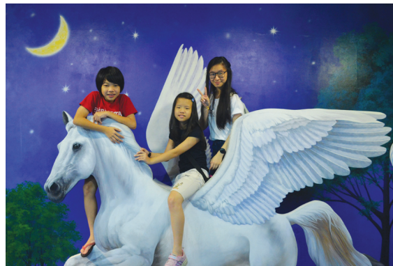
Free Tuition Kids on a Pegasus