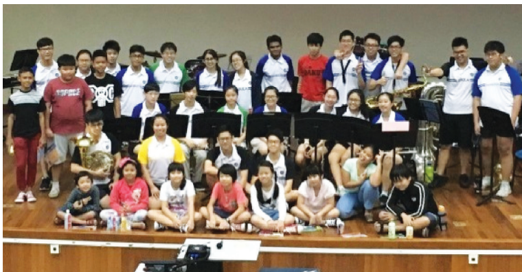
Group photo at JJC