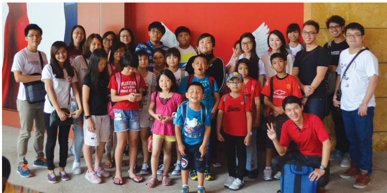
Group photo to the Trick eye Museum